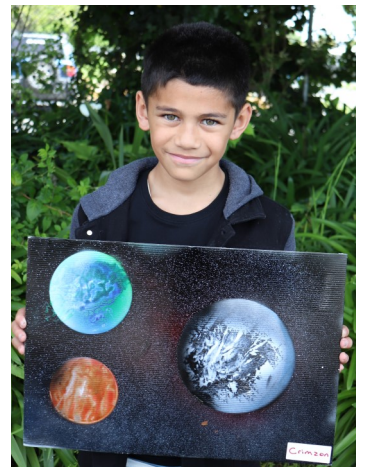
Take a look at this amazing solar system spray paint art from Room 17 students