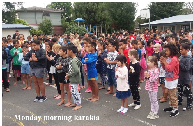
Monday morning karakia