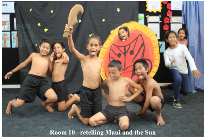
Room 10 –retelling Maui and the Sun

A big thanks to all our whanau who assisted with the kai to our staff for all their contributions during the week