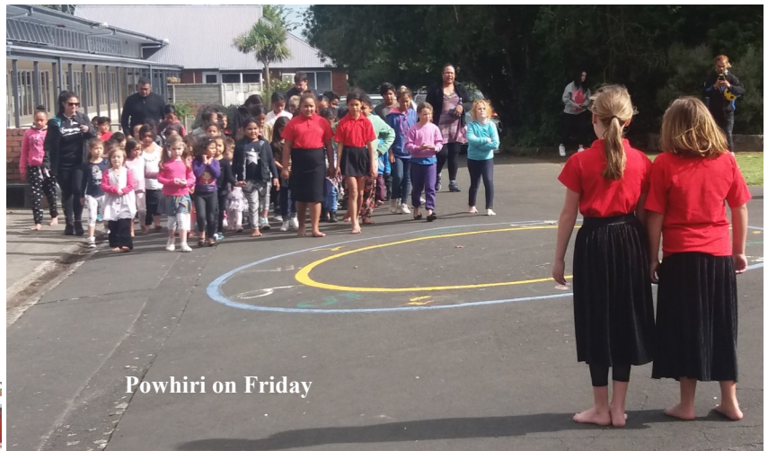
Powhiri on Friday