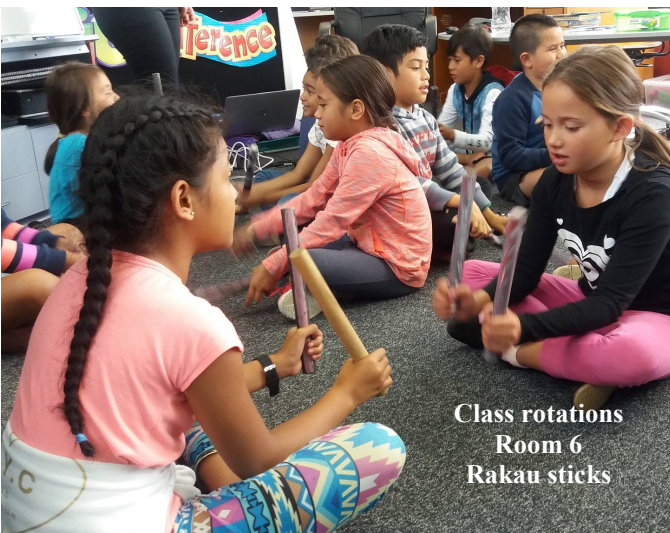
Class rotations Room 6 Rakau sticks