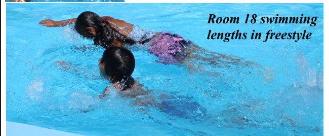
Room 18 swimming lengths in freestyle

Please remember togs, towel and plastic bag on swimming days.