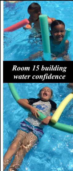
Room 15 building water confidence

In Term 1, our Physical Education programme is Swimming.